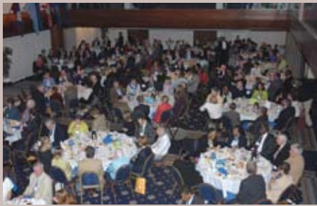
Next Step Breakfast at the National Press Club.

On May 8th, Samaritan Ministry hosted the largest fundraiser in the organization's history. We welcomed over 260 guests for breakfast at the National Press Club and raised more than $400,000 in gifts and pledges in support of our program. Our Board of Directors generously pledged $120,000. We announced the formation of a new partnership called the Next Step Giving Society . Members pledge to give contributions over the next five years. This initiative will help strengthen our financial foundation and sustain and expand Samaritan Ministry's programs.