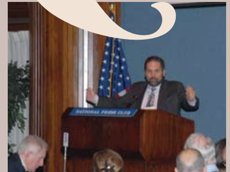
Ray Suarez is the Master of Ceremonies for the Next Step Breakfast.